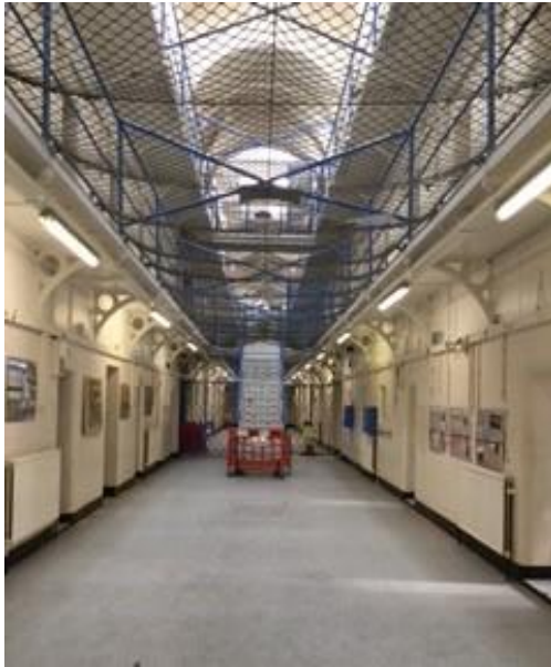
Northallerton Prison interior and exterior images, all Fortuna (2018)

Oxford Prison dates back to 1071 when it was originally part of Oxford Castle and is both a Scheduled Ancient Monument and Grade 1 listed. 1 Since its closure it has been converted into a luxury hotel with elements of its former history being displayed through the retention of some cells and a small museum. The room that was used for hangings has however been closed off with no access.