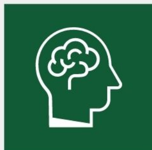
Cognitive Decline & Periodontitis