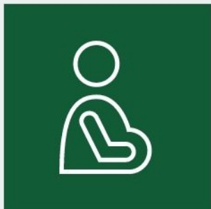
Pregnancy & Periodontitis

Visit the knowledge hub to access e-learning modules: