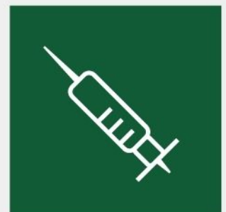
Diabetes & Periodontitis