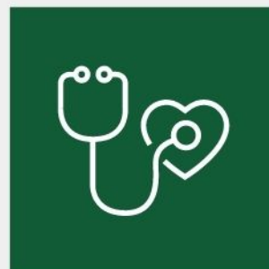
Cardiovascular Diseases & Periodontitis