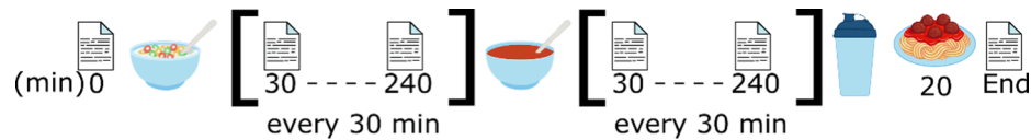
Fig. 1. Schematic of experimental trial protocol. Document symbol denotes VAS completion, food images denote breakfast/lunch/evening meal, drinks bottle denotes beverage consumption.